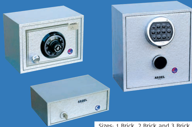
Sizes: 1 Brick, 2 Brick and 3 Brick